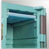
Moulded eutectic plate support