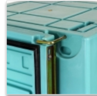
EPDM one-piece frame seal. Door hold-open system.