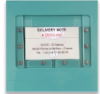
Embedded label holder