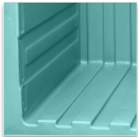
Monobloc rotomoulding. Internal convection grooves