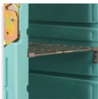
Stainless steel middle shelf with stainless steel supports