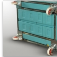
Flush mounted steel frame, 4 wheels Ø 100 mm, 2 fixed and 2 swivelling