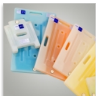
TOP 370 eutectic plate