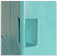
2 embedded moulded handles