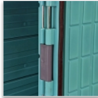
Double axles door hinge. Door opens to 270°