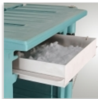
Dry ice drawer