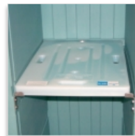
2 nd TOP 370 eutectic plate in the middle, with stainless steel supports