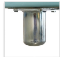
4 metal feet Ø 60 mm