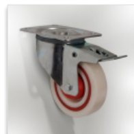
2 brake wheels Ø 100 mm