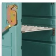
Plastic coated middle shelf with stainless steel supports