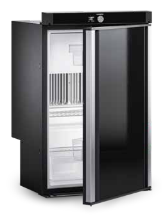
Wheel arch model available