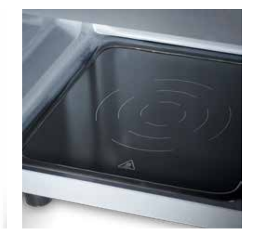
INTEGRATED CERAMIC PLATE Easy to clean, no moving parts