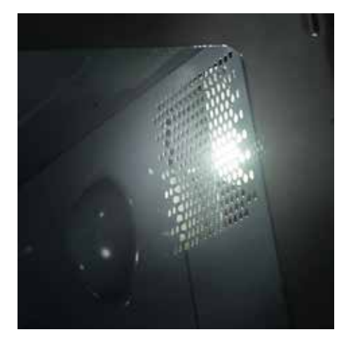
ADDED CONVENIENCE LED interior light lets you see how your food is doing