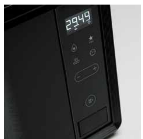
USER-FRIENDLY CONTROLS With large, easy-to-read digits and display symbols