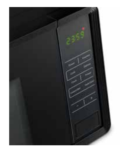
USER-FRIENDLY Large, easy-to-read digits and display symbols