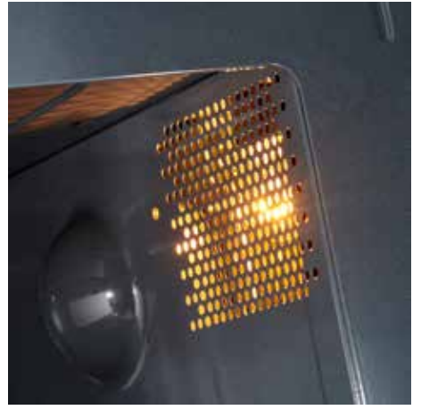
ADDED CONVENIENCE Interior light to see the cooking progress of your food