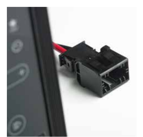
PLUG-N-PLAY With 24 V power supply connector