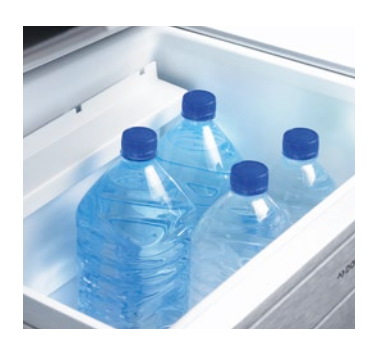
Vertical space for 1.5 and 2 litre bottles standing