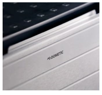
Sturdy housing and attractive design