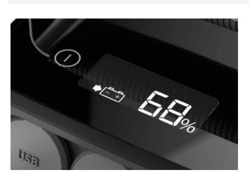
High capacity – Lithium iron phosphate (LiFePo4) battery provides 40 Ah or 512 Wh of power in a small package

When paired with the CFX3 45, the PLB40 can supply 53 hours of power (When fridge temperature is +4 ^{\circ} C and ambient temperature +25 ^{\circ} C) ensuring you never miss feeding time.