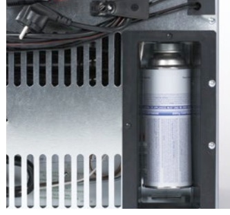
Each 220 g gas cartridge last up to 24 hours