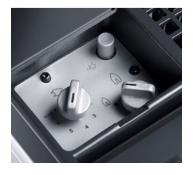
3-stage flame regulation in gas mode, piezo ignition, thermostat regulation in 230-volt mode